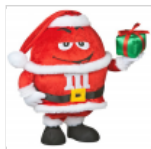
M&M's Preps for the Holidays