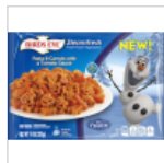
Birds Eye Debuts Disney Pasta